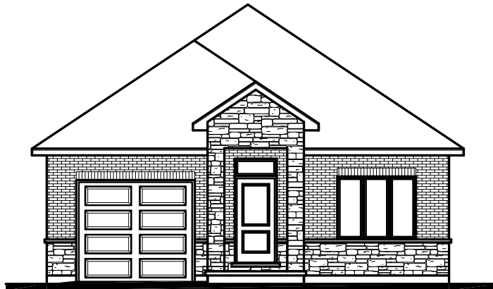
FRONT ELEVATION-UPGRADED BRICK OPT.