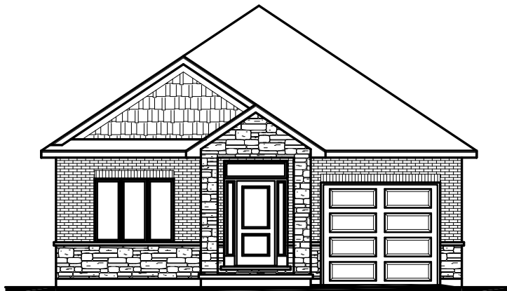
FRONT ELEVATION-UPGRADED BRICK OPT.